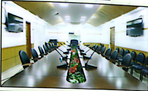
▶ Mini Conference Room