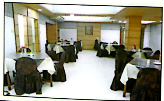
▶ KARNOFULY CANTEEN

There are six air-conditioned canteens in BIAM that cater regular meals to the trainees and guests. Six hundred people can be served at a time in special events. Arrangements for special dinner are also available on prior reservation.