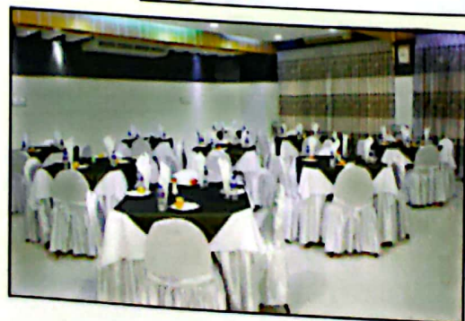
◀ KARATOWA CANTEEN