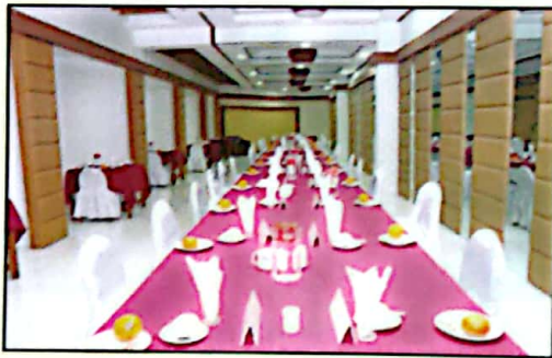
◀ Saheed Nurul Amin Khan Memorial (Multipurpose) Hall Wings Canteen