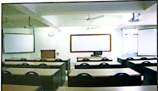
Shaheedul Jahir Hall