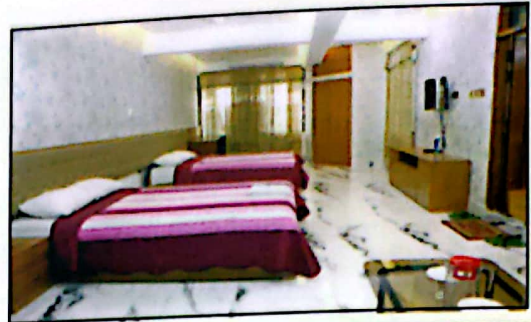
◀ VIP ROOM 7005