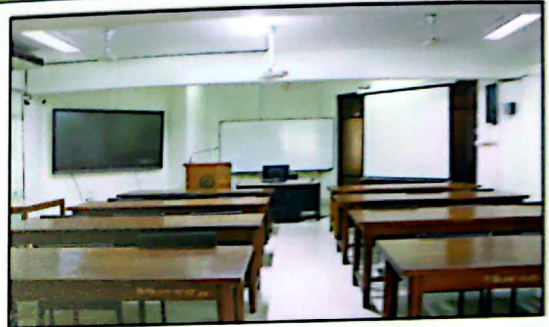
Shaheed Kudrat-E-Elahi Hall