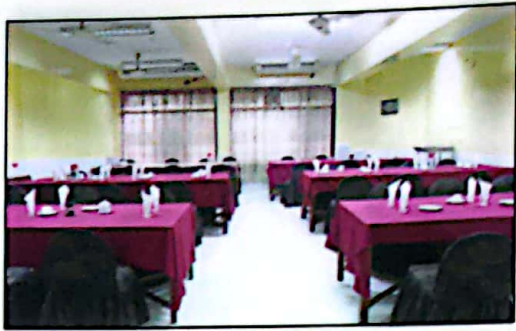
◀ MADHUMATI CANTEEN