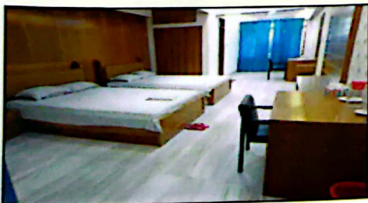
◀ VIP ROOM 7006

With 213 beds & 98 rooms, BIAM provides accommodation facilities to the participants of different residential training courses. The global standard dormitory is also used as a guest house. Both national and international guests can reside here with comfort, safety and security at fair price. Members of the Administrative Service Association can reside here paying nominal charges.