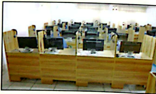
▶ Shamsuddin Computer Lab

To facilitate training and computer use efficiency three air-conditioned Computer Lab having capacity of 25-30 persons each.