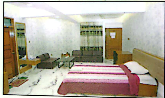
◀ VIP ROOM 7005