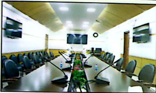
◀ Mini Conference Room