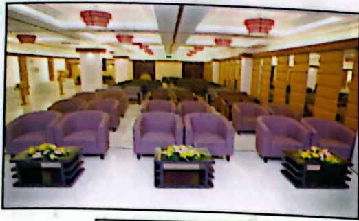
◀ Saheed Nurul Amin Khan Memorial (Multipurpose) Hall