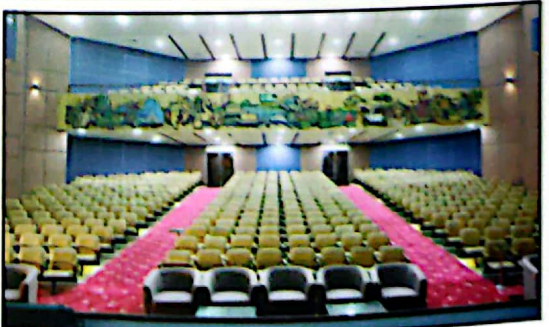
Saheed A.K.M Shamsul Haque Khan Memorial (Auditorium) Hall