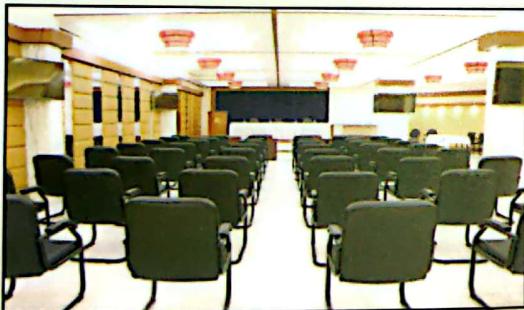
▶ Saheed Nurul Amin Khan Memorial (Multipurpose) Hall