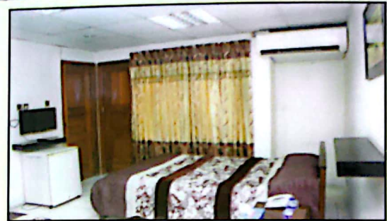
▶ VIP ROOM 501