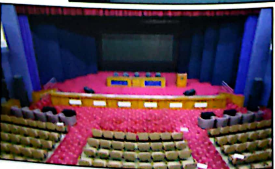
Saheed A.K.M Shamsul Haque Khan Memorial (Auditorium) Hall