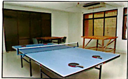
◀ Common Room

There is a small common room with TV and indoor sports facilities to serve the recreational purpose of the participants and guests. Sports materials such as table tennis, carom and chess etc. are available there.